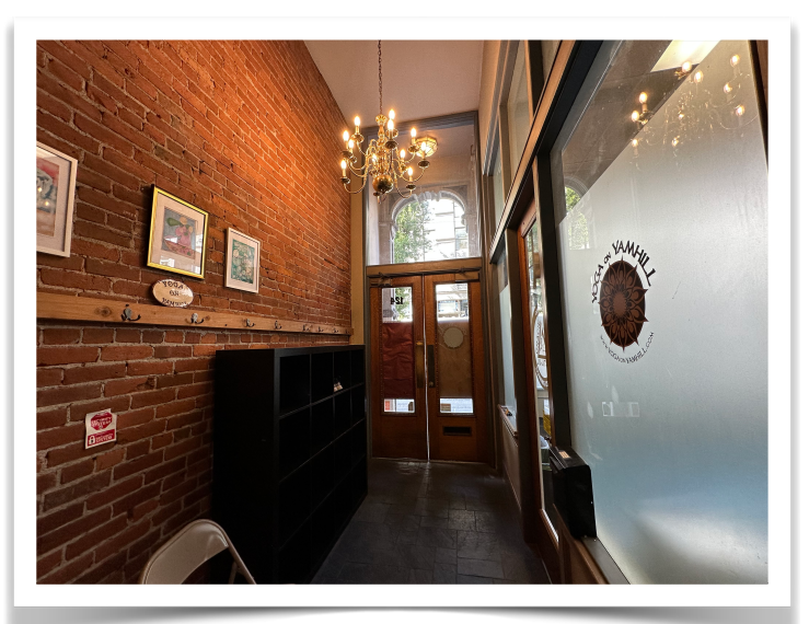
Front Door Entry