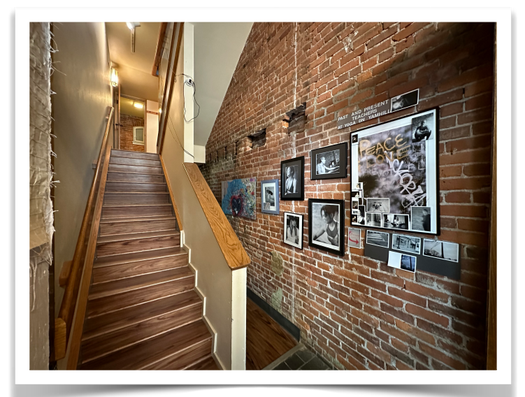
Common Area Hallway